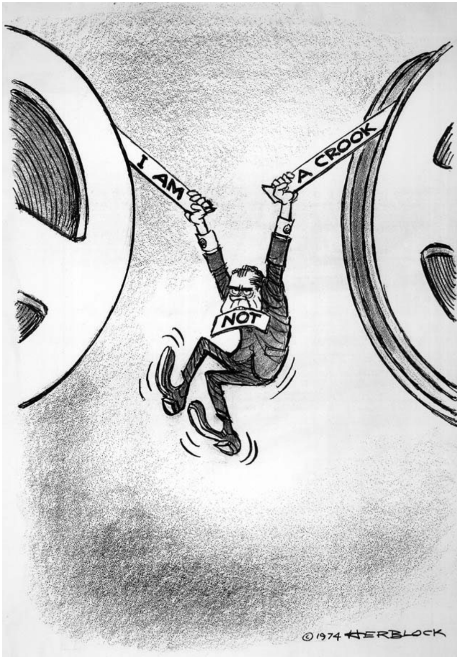
No caption: Drawing of Nixon between two tapes with "I AM NOT A CROOK" writing on tape. A 1974 Herblock Cartoon, copyright by The Herb Block Foundation