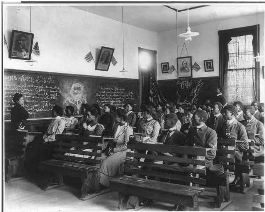
History class at Tuskegee Institute, Tuskegee, Alabama

Tuskegee: https://www.loc.gov/item/98503043/ (also used in the Anticipate activity)