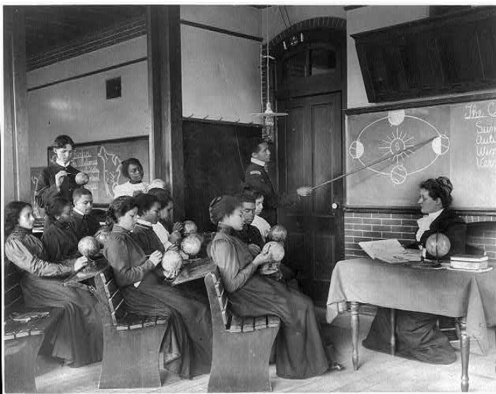
Students studying Earth's rotation around the sun, Hampton Institute, Hampton, Virginia