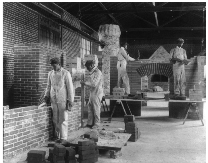
Students in a bricklaying class, Hampton Institute, Hampton, Virginia