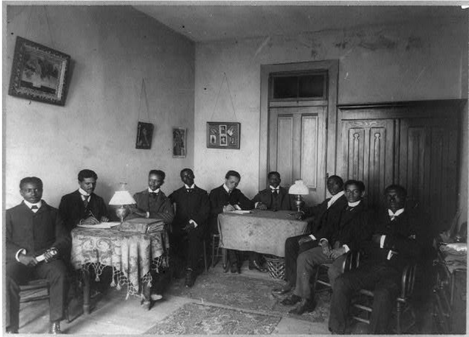
Students in an Extempo (debate) Club, Fisk University, Nashville, Tennessee

Fisk University: http://loc.gov/pictures/resource/cph.3b47387/