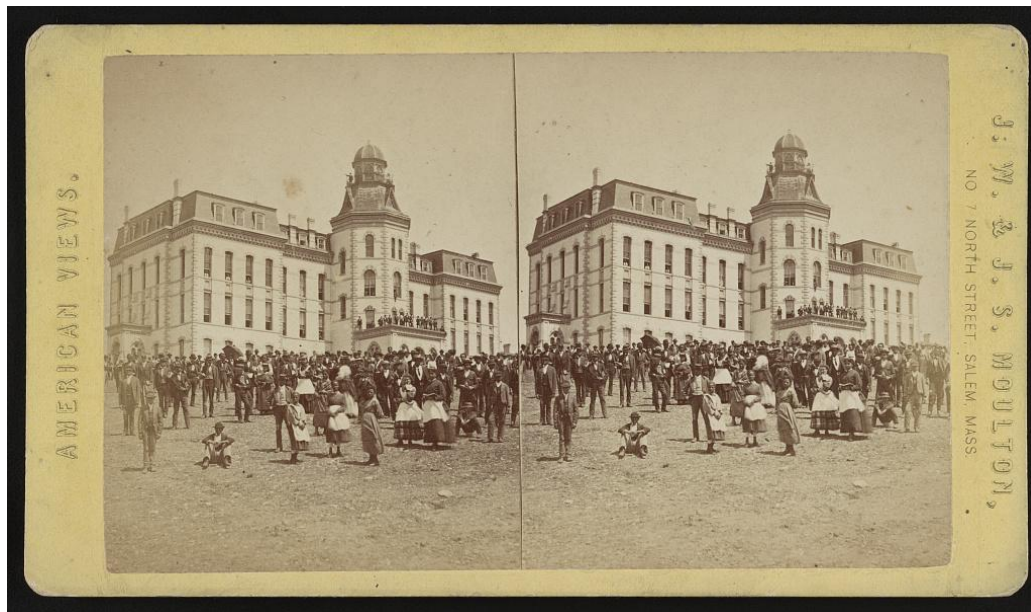
Students on the lawn of Howard University, Washington, DC

Howard University: https://www.loc.gov/resource/stereo.1s07887/