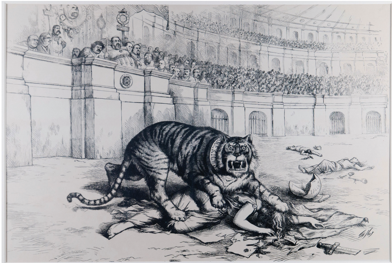
"The Tammany Tiger Loose," Thomas Nast, Harper's Weekly, November 11, 1871