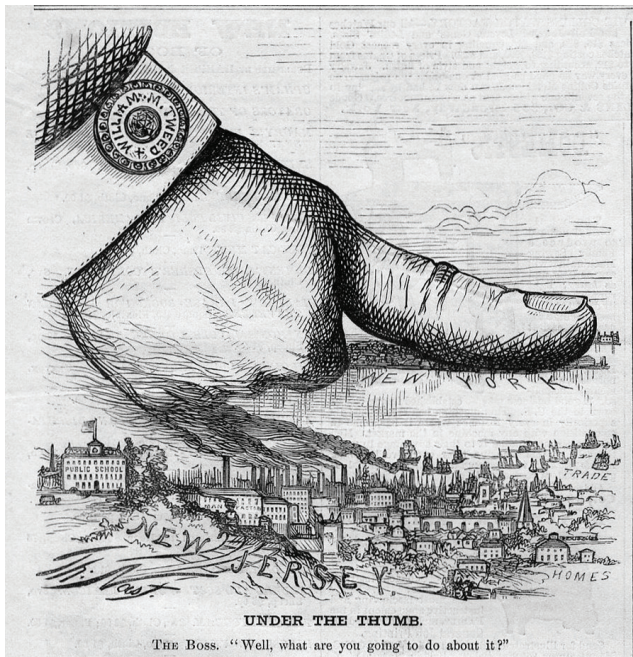
"Under the Thumb," Thomas Nast, Harper's Weekly, June 1871.