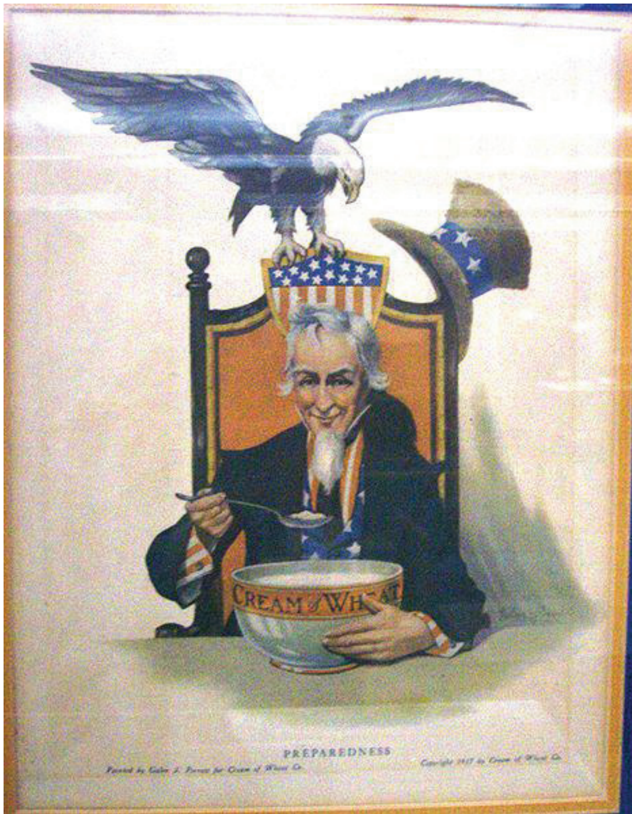
Cream of Wheat, 1917