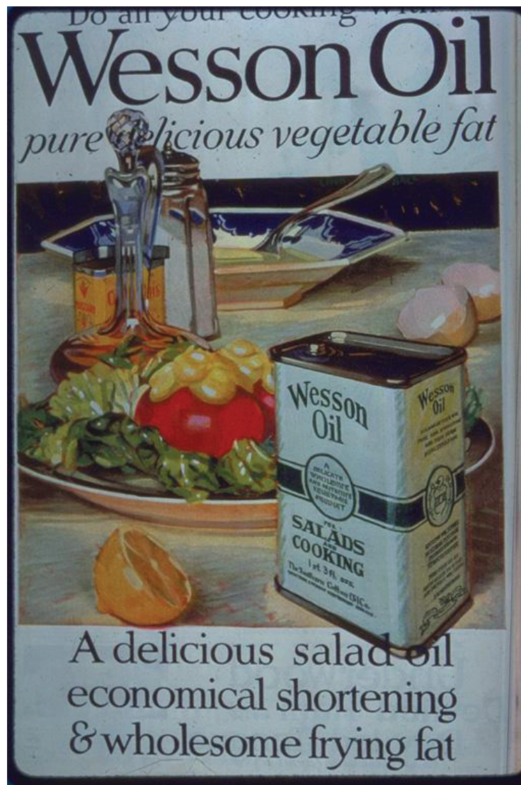
Wesson Oil, 1919