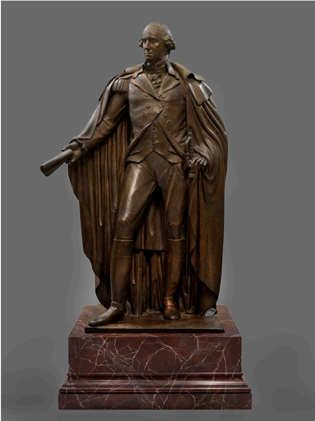
Washington Resigning His Commission, by Ferdinand Pettrich, c. 1841, painted plaster, 86 in. × 48 1/2 in. × 36 3/8 in.