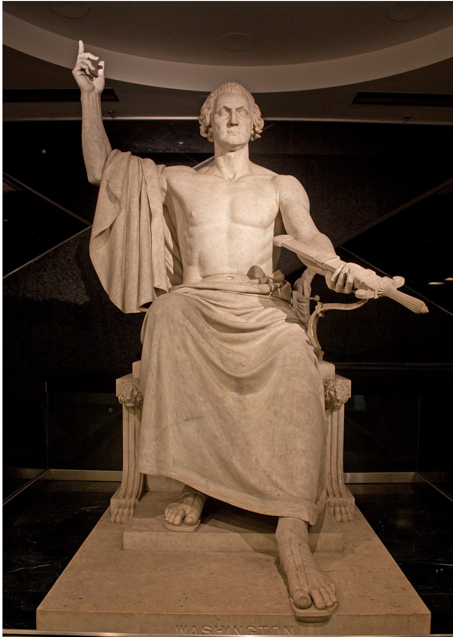
George Washington, by Horatio Greenough, 1840, marble. 11-feet, 4-inches high, Smithsonian American Art Museum.