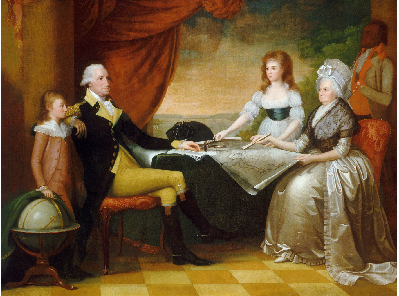
The Washington Family, by Edward Savage, 1789–1796, oil on canvas, National Gallery of Art.