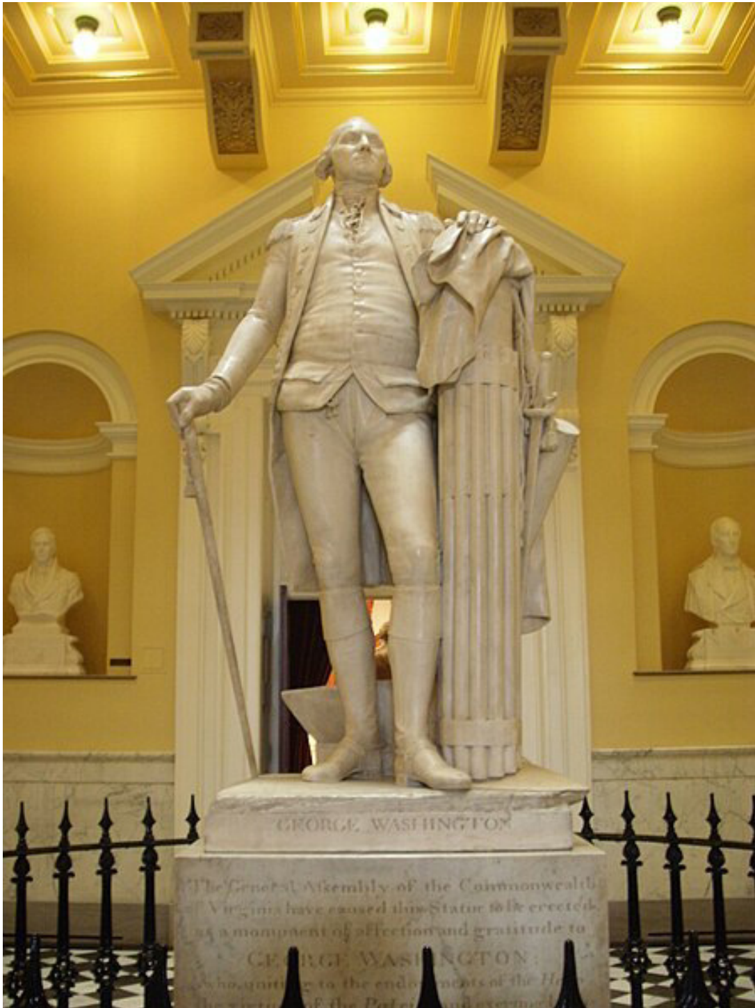
George Washington, by Jean-Antoine Houdon, 1788–1792, marble, 6-feet, 2-inches high, in the state capitol building, Richmond, Virginia.