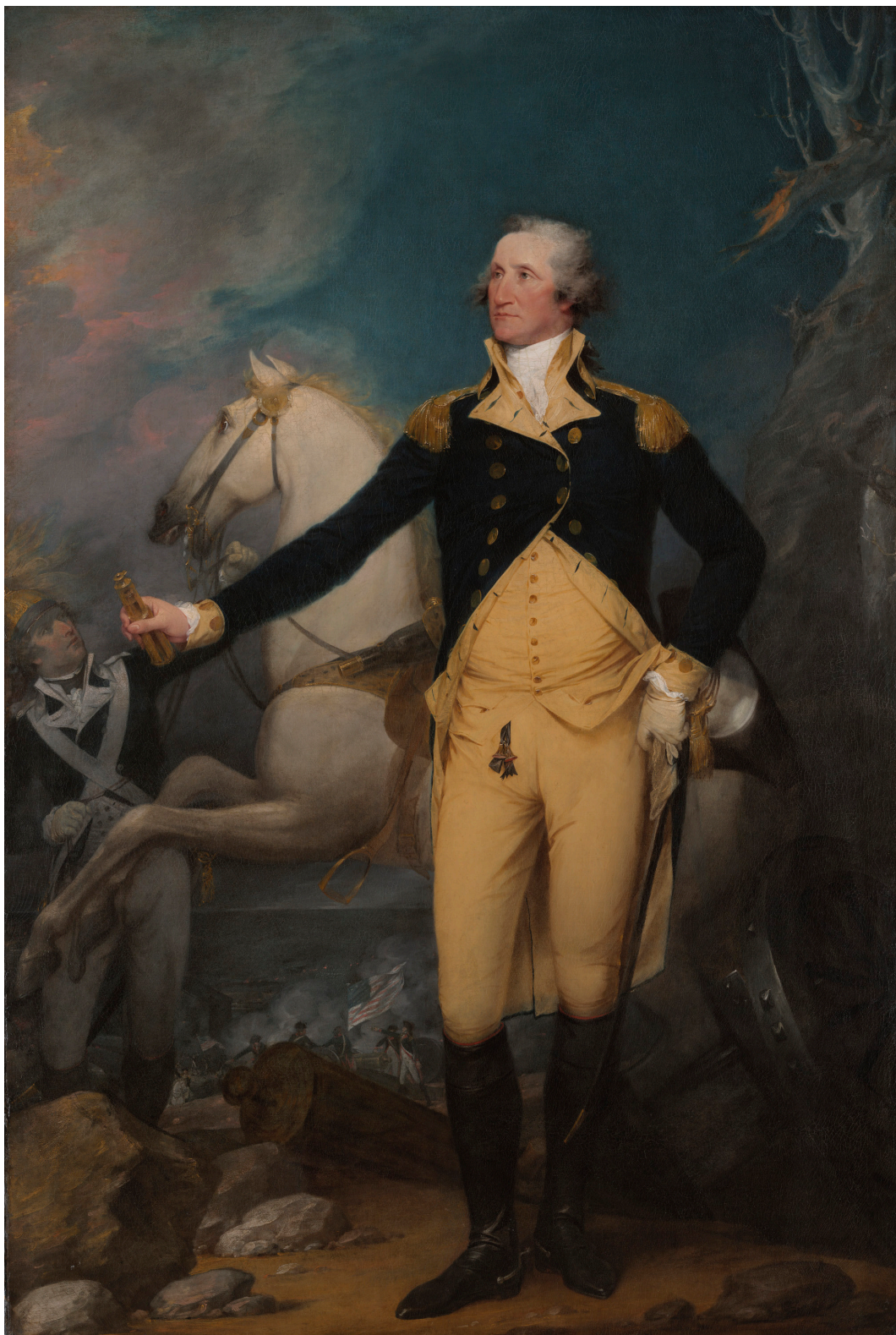
General George Washington at Trenton, oil on canvas, 1792, Yale University Art Gallery.