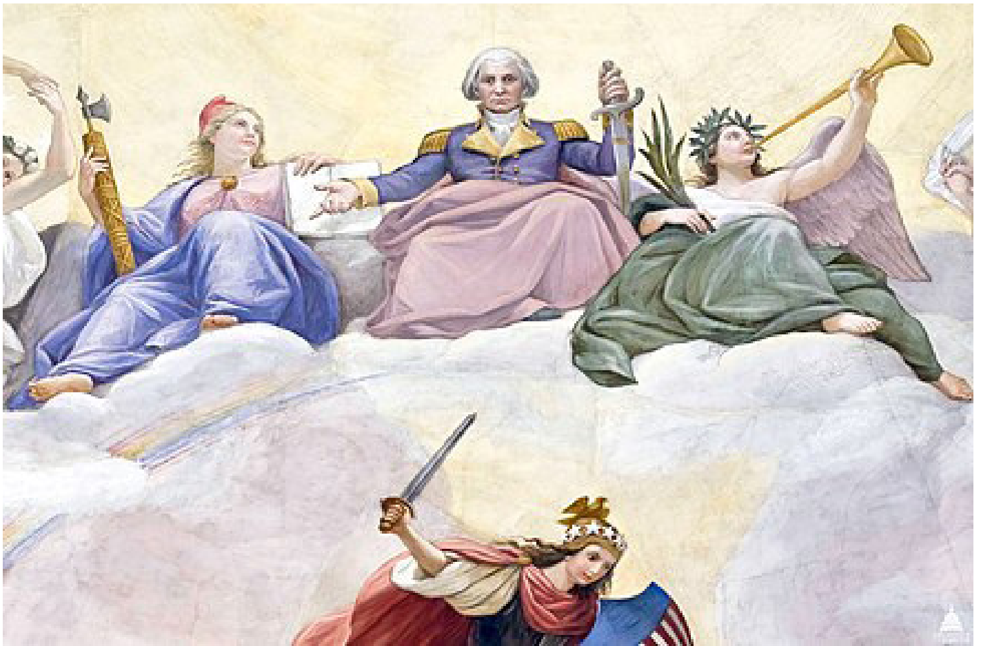
Detail from The Apotheosis of Washington , by Constantino Brumidi, 1864, as seen looking up inside the Capitol rotunda.