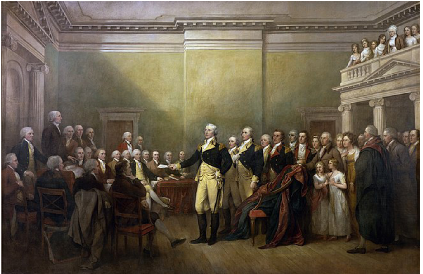
General George Washington Resigning His Commission, by John Trumbull, 1824, U.S. Capitol Rotunda.