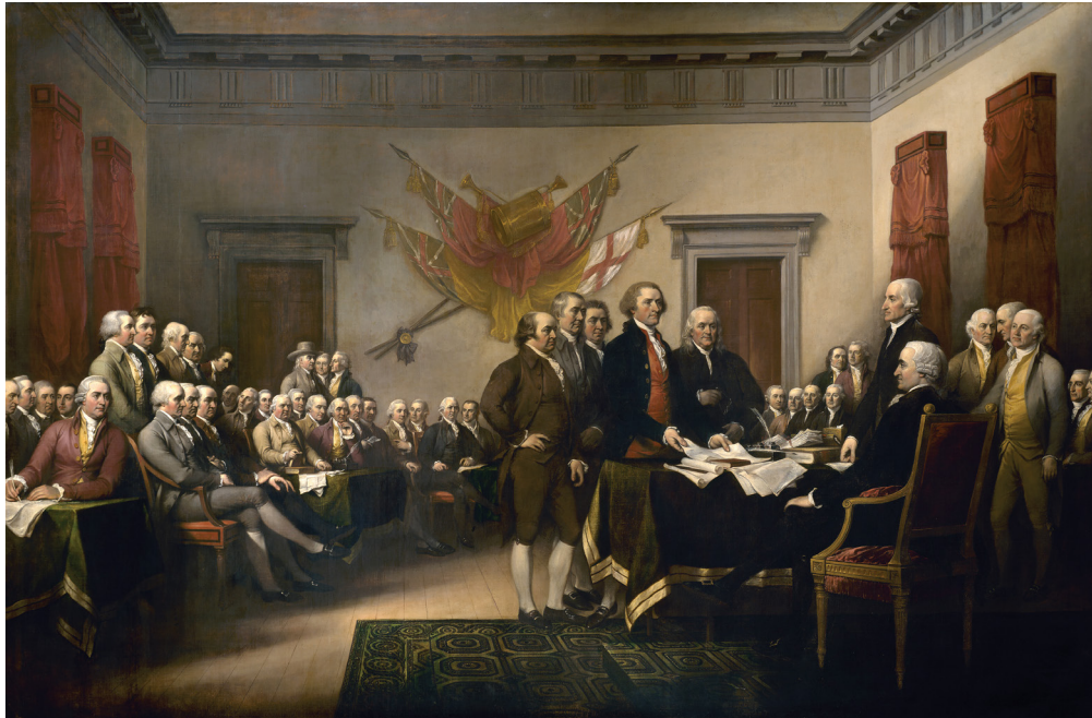
John Trumbull, Public domain, via Wikimedia Commons

Connection to Being an American principles and virtues: The Declaration of Independence is the foundational document for the United States. It sets forth important principles that guide the country to this day, such as liberty and equality.